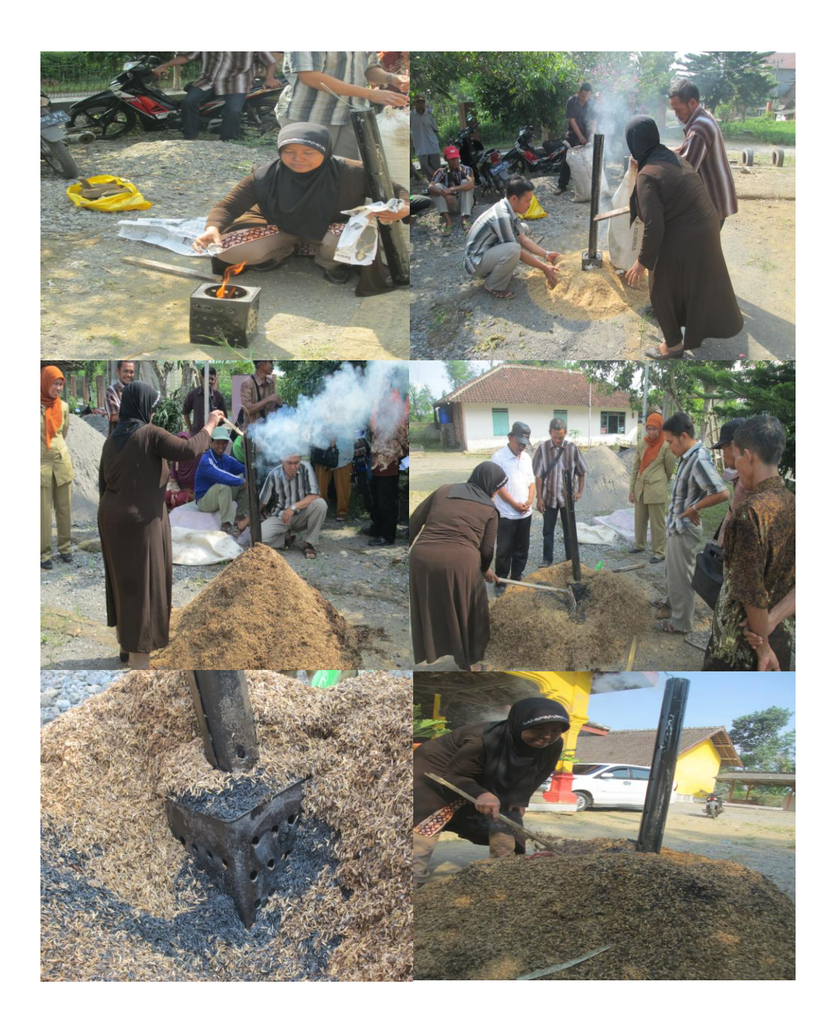
Figure 1e : Simple installation of biochar production